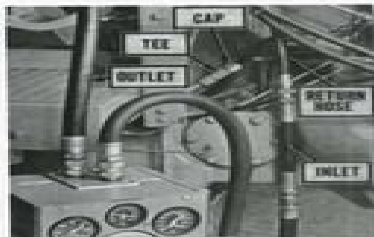
Flow from " Tee" fitting shown in Fig. 6. Install a cap over open end of " Tee"