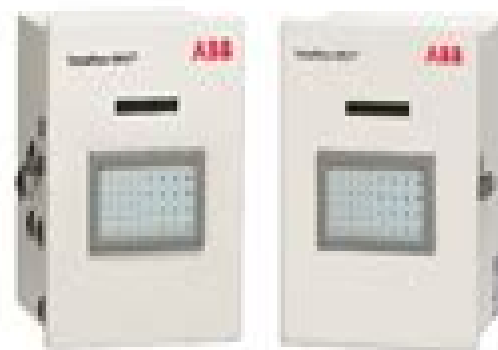
ABB MEASUREMENT & ANALYTICS XSeries™ XPC and XRC Quick Start Guide