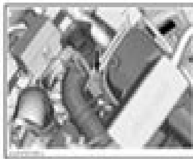
FIGURE 7 7. Remove air intake tube retaining screw