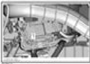
FIGURE 6 6. Remove air intake tube retaining screw