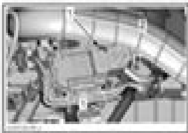
FIGURE 5 5. Disconnect both engine harness connectors (HIC)