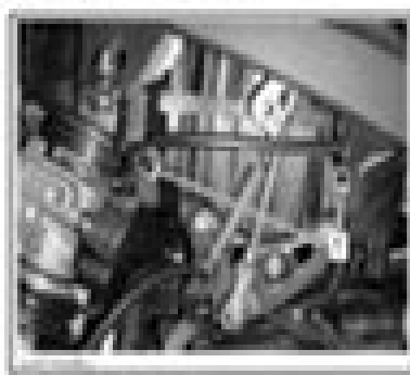
FIGURE 10 10. Detach gearshift vent hose from filter housing