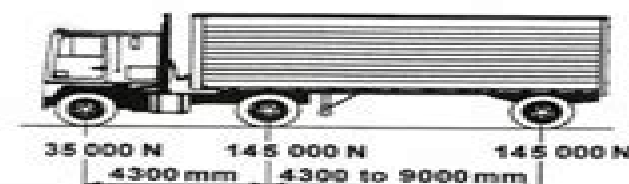
Figure 2(A) Truck loading of HL-93.