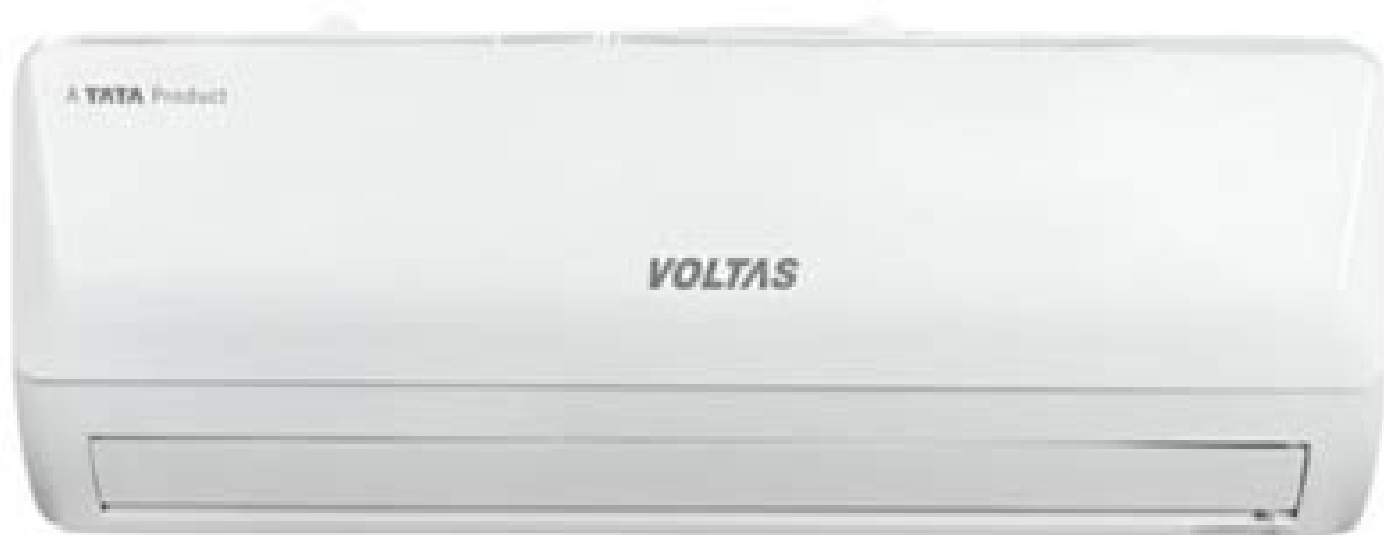
Voltas 245V Venus Plus 2 Ton 5 Star, Inverter Split AC