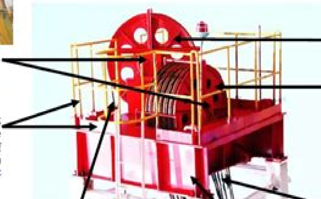
First Line (Wire Rope) API RP 9B