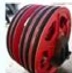
Cluster Line (Wire Rope) API RP 9B