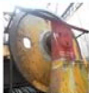
Shafts & Shaft Houses API SPEC 4F