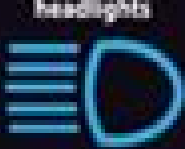
Main beam headlights