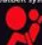
Airbag and seatbelt system