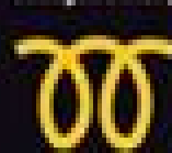
Engine management lamp