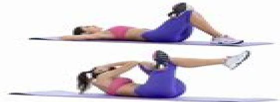
10 KNEE TOUCHES