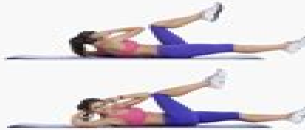
10 BICYCLE CRUNCHES