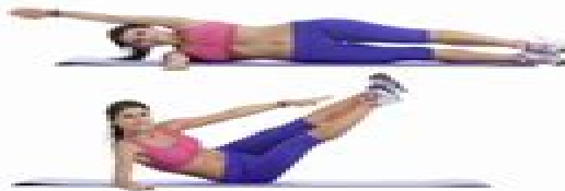
10 SIDE V-UPS (PER SIDE)