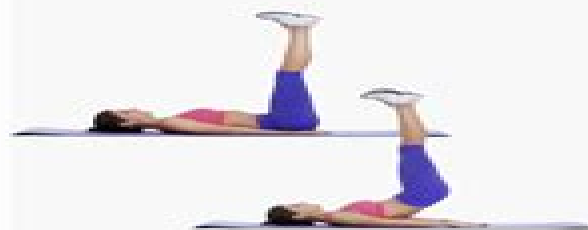
10 LEG LIFTS