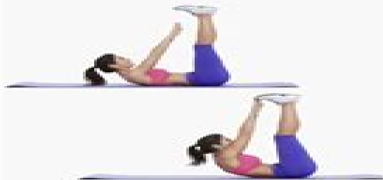
10 TOE TOUCHES