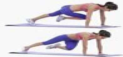
10 MOUNTAIN CLIMBERS