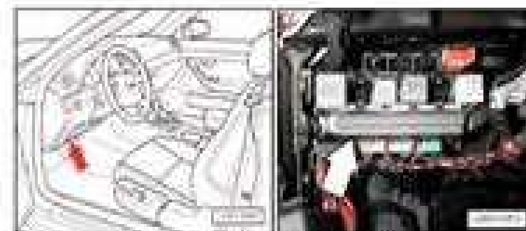
2018 Vehicle Electrical System Control Module

bl = blue wh = white brk = black br = brown grn = green bl = blue gr = grey l = lead yel = yellow or = orange