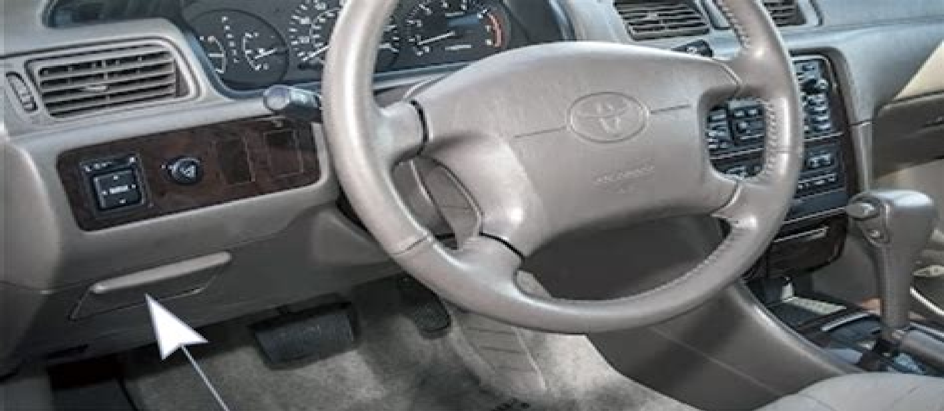
Instrument Panel Fuse Block