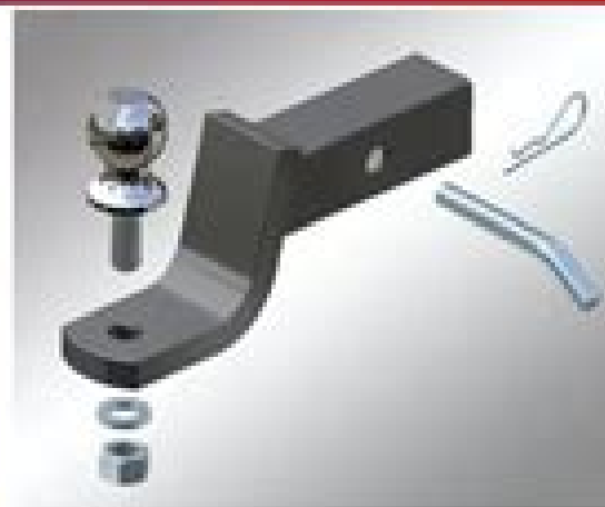
2: Hish Mount S-2 – Product Assembly