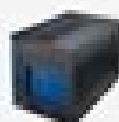
EDGE AI SYSTEMS