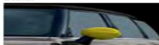
Energetic Yellow Mirror Caps MINI Electric models only