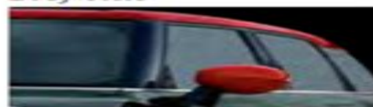
Chili Red JCW models only

Also available on MINI Electric Hardtop 2 Door: Vigorous Grey mirror caps (not shown).