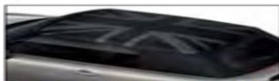
Optional Union Jack Soft-top Convertible models only

Certain body color and roof/mirror combinations are not available. Check with your Dealer for details.