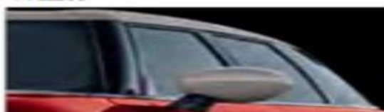
Melting Silver Clubman & Countryman models only