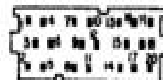
CN781-C 20Pin Connector