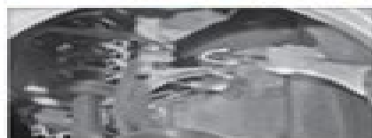
Step-by-step front suspension component replacement. 40 Front Suspension