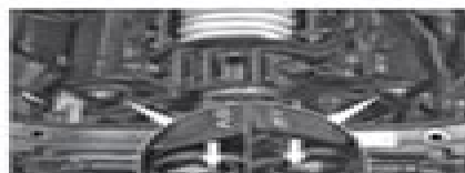
Timing belt replacement (2.8 liter engine). 13 Timing Belt, Crankshaft Pulley, Rear Main Seal