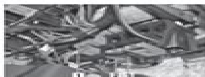
Fuse boxes, relays and grounds using an extensive electrical component locator. 97 Fuses, Relays, Component Locations