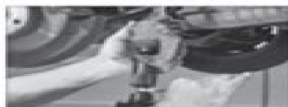
Detailed front and rear brake service. 46 Brakes—Mechanical