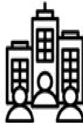
Individuals, business entities, nonprofit organizations, or government entities

A CPA or CA from a public accounting firm or self employed