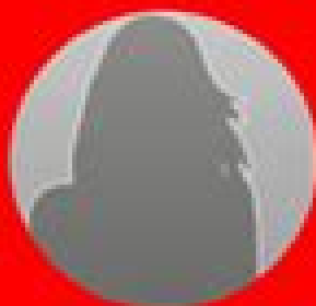
testqagold02 35F Campbell, CA, USA