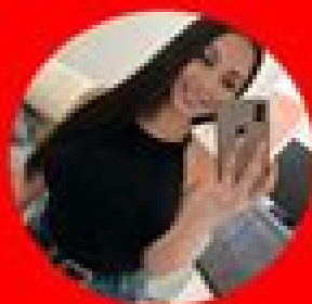
vd7011988 34F Campbell, CA, USA