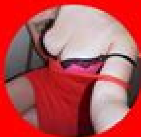
cuckoldswife... 30F Campbell, CA, USA