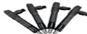
FUEL INJECTOR MORE