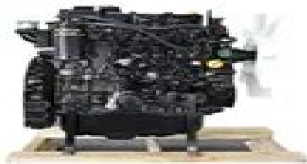
ENGINE ASSY MORE