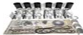
OVERHAUL KIT MORE