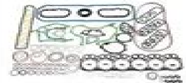
FULL GASKET KIT MORE