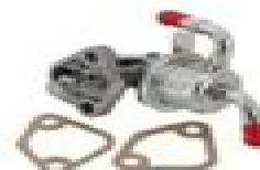
FUEL PUMP MORE