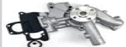
WATER PUMP MORE