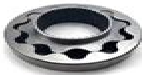
OIL PUMP MORE