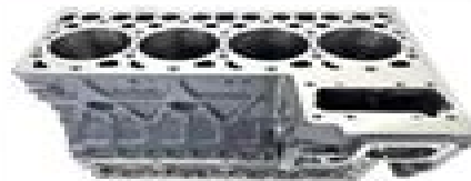
CYLINDER BLOCK MORE