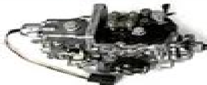
FUEL INJECTION PUMP MORE