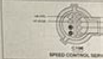
SPEED CONTROL, SENSOR