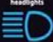
Main beam headlights