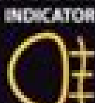
FOG LAMP INDICATOR