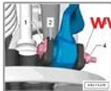
Fig. 142: Identifying Key T40049 At Rear On Cranksh.

→ Remove coil spring. Refer to (2001-2002).