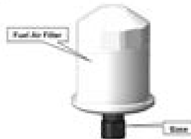
Fig. 18 Fuel air filter

The fuel air filter located on top of the Fuel Pod under the fit area hatch should be changed every 3 to 6 months. The fuel air filter is removed by unscrewing it from the base attached to the fuel cell. A new filter is attached by screwing it onto the threads of the base that extends from the fuel cell.