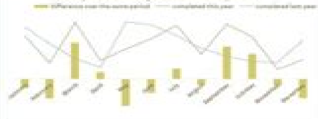
Comparative analysis of the same period