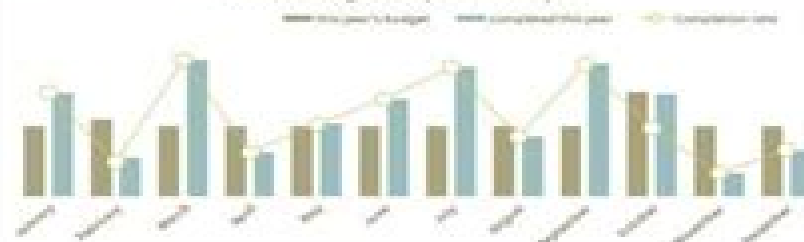
Annual Budget Completion Analysis