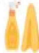
Screen Cleaning Kit