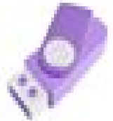
USB Flash Drive