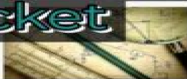
Unit 5: Connected Things-Up