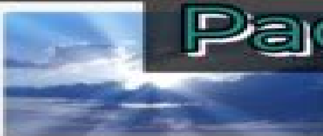
Unit 4: Nuclear Reactions