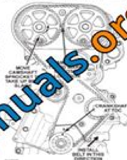
Fig. 25 Timing Belt—Installation