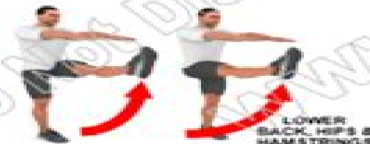
LOWER BACK, HIPs & HAMSTRINGS