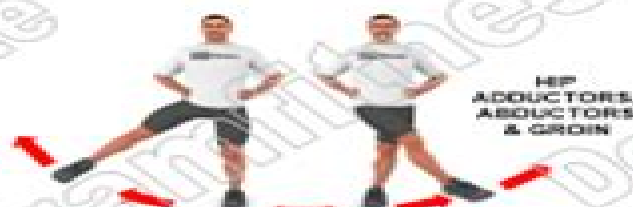
HIP ADDUCTORS, ABDUCTORS & GROIN