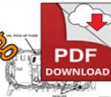
Fig. 27 Oil Pan Gasket Installation