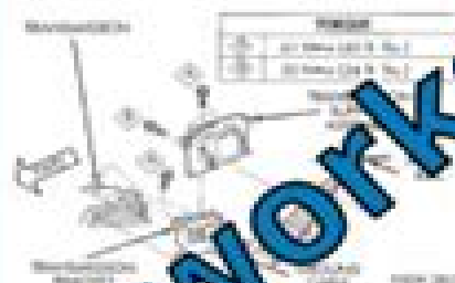
Fig. 23 Engine Mounting—Left