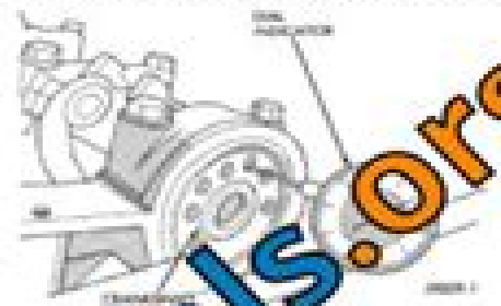
Fig. 18 Oil Pan Removal—2WD