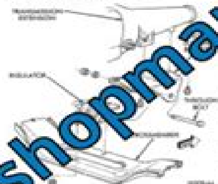
Fig. 17 Engine and Rear Support—2WD Vehicles

Remove the steel nuts attaching the insulator to the transmission extension (Fig. 20). Raise the transmission and engine slightly. Remove steel nuts attaching insulator to cross member (Fig. 20). Remove insulator.