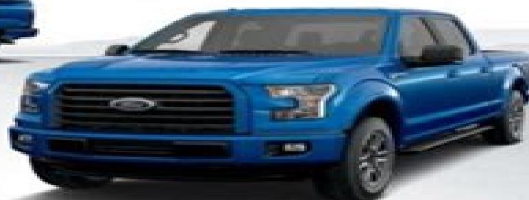
Shown as Mid 301A with B62, SuperCrew 4-door Blue Flame.