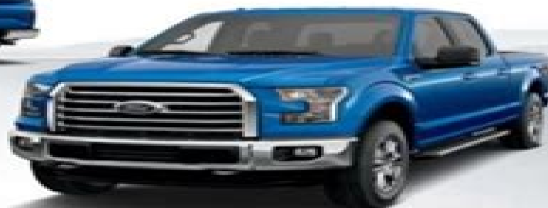
Shown as Mid 301A with B68, SuperCrew 4-door Blue Flame.