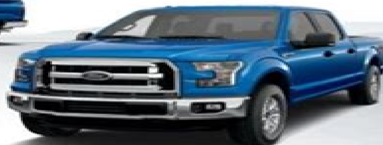
Shown as Mid 301A SuperCrew® 4-door Blue Flame.