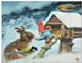
A painting of a grumpy & then humorous

For thousands of years, stories of mythical creatures have captured the imaginations of people all over the world. These creatures make their appearances in legends, folk tales and bedtime stories and each have their own unique powers and personalities. Wise or mischievous, big or small, mischievous or helpful, winged or horned, no two mythical beings are the same. Let's dive into the world of mythology and learn more about some creatures from all over the globe!