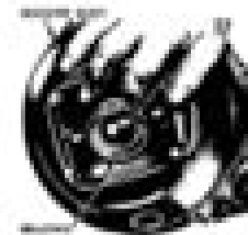
FIG. 44—Return to Reaction Body Equipment

the ends of the hydraulic push rod. Apply a coat of grease to the adjusting roller ends. Apply clockwise pressure to the roller until the roller end of the push rod and the reaction disc.