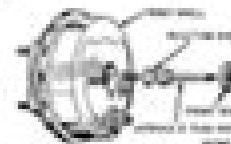
FIG. 43—Installing Reaction Box, Push Rod and Front Seal

8. Place the rear shaft in a vice. Apply clockwise adjustment pressure.