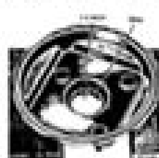
FIG. 42—Installing New Disc

6. Push the filter into place in the plate hole. Press the filter against the hole using circular motion to help it through the plate. (Fig. 43).