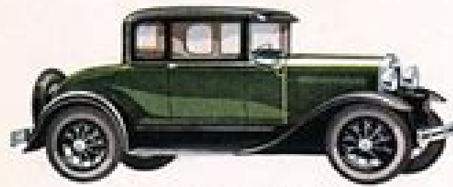
NEW FORD DELUXE COUPE

Truly Deluxe in line, color and appointments. Driver's seat is adjustable. Rear seat has folding center arm and side arm rests. Mohair or Bedford Cord upholstery of lovely, lasting texture is optional.