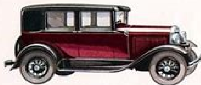
NEW FORD DELUXE SEDAN

Sweeping lines and attractive sport treatment. Seat and back cushions upholstered in genuine leather. One wide door opens to front and rear seats. Adjustable driver's seat. Fender well for spare wheel on left.