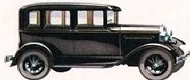
NEW FORDOR SEDAN

Another example of Ford values—low, fast lines, beautiful colors, and outstanding performance. The substantial top is easy to put up or take down. Gleaming stainless steel is used for many exterior metal parts.