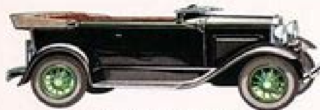
NEW FORD DELUXE PHAETON

Combines the roadster's airy freedom and the snug comfort of a coupe. The convertible top may be easily raised or lowered. The adjustable seat is upholstered with rich tan Bedford cloth. Equipped with rumble seat.