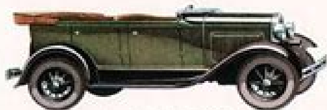
NEW FORD PHAETON

Another example of Ford values—low, fast lines, beautiful colors, and outstanding performance. The substantial top is easy to put up or take down. Gleaming stainless steel is used for many exterior metal parts.