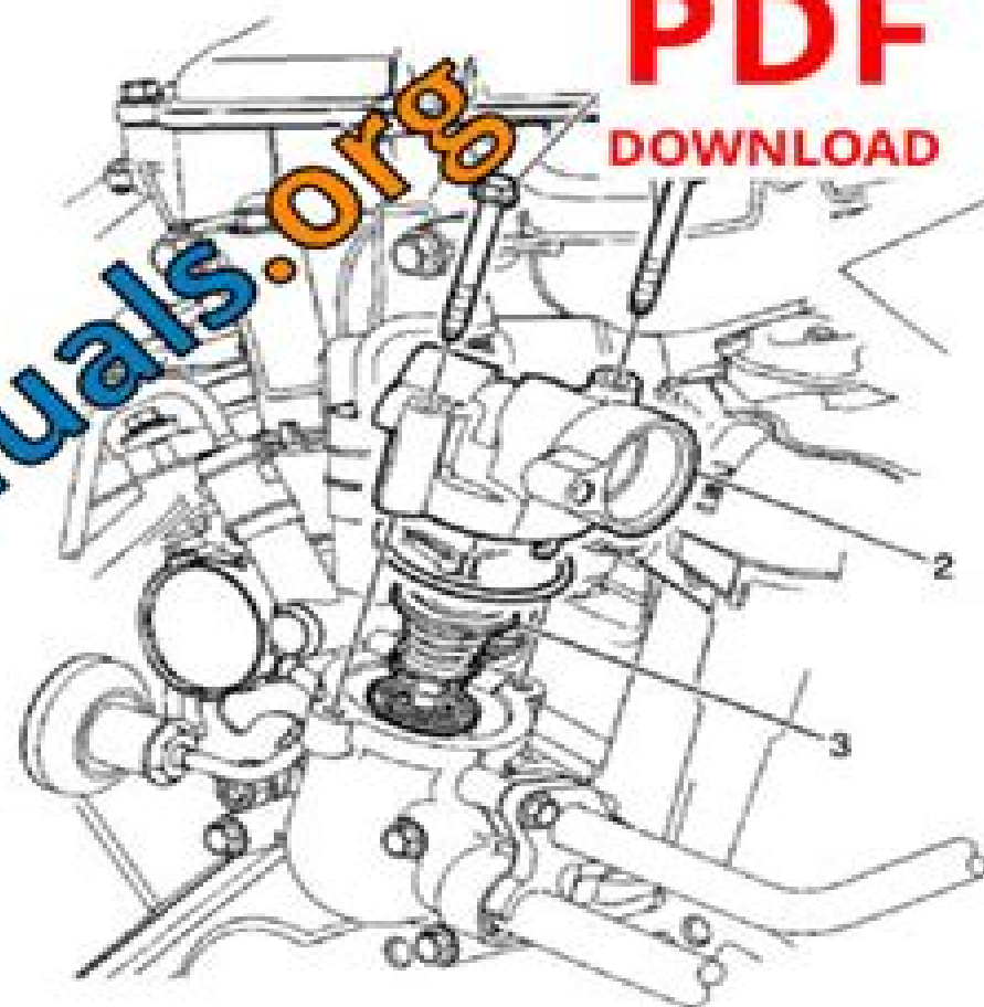
Fig. 55: Engine Coolant Thermostat (LIT)

Tighten the M8 bolts to 25 N·m (18 lb·ft).