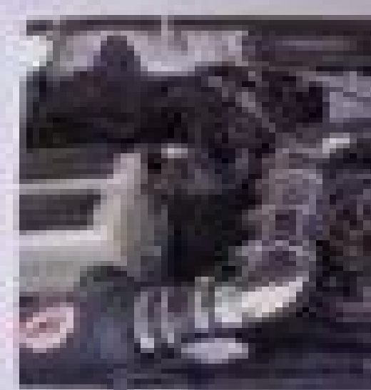
1995 Ford E-Series Wiring