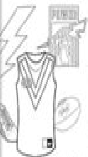
Port Adelaide Power