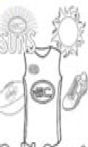
Gold Coast Suns