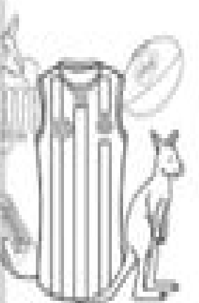
North Melbourne Kangaroos