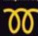
Engine management lamp