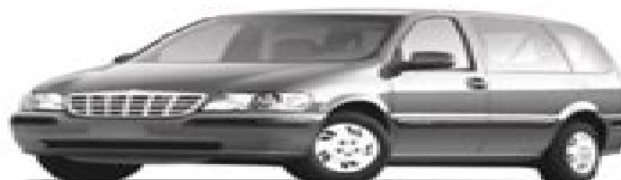
Chevy Venture Regular Wheelbase 3-Door