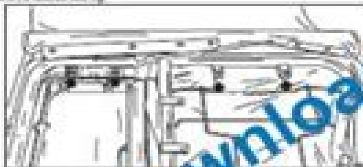
(a) Interior view (b) Exterior view