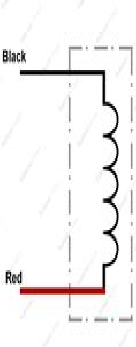
3-Phase Motor Windings