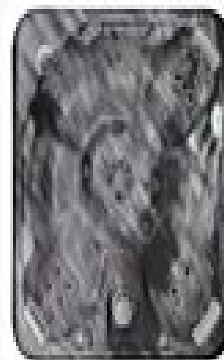
Storm Clouds Luster Swirl