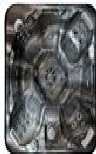
Midnight Canyon+ Luster Swirl