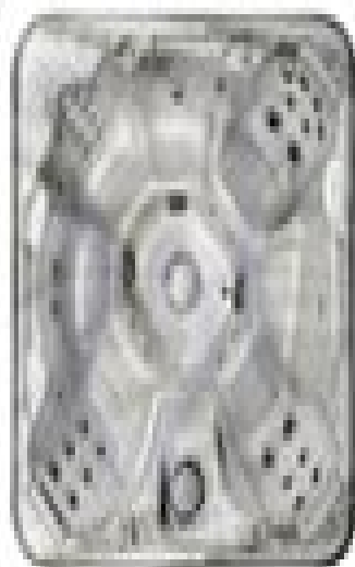
Glacier Mountain+ Marble