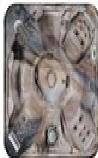
Tuscan Sun+ Luster Swirl