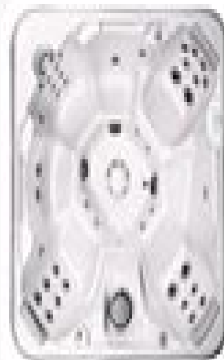
White Pearl+ Luster