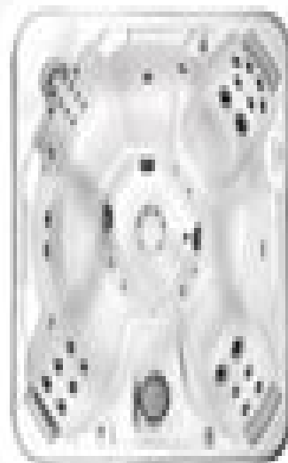
Silver Marble+ Marble