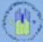
Department of Housing and Urban Development