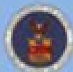
Department of Labor