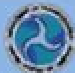
Department of Transportation