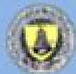
Department of Agriculture