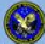
Department of Veterans Affairs