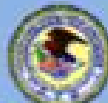
Department of Justice