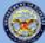
Department of Defense