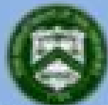
Department of the Treasury