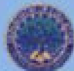
Department of Education