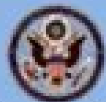
Department of State