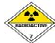
Class 7 Radioactive