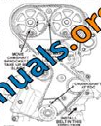
Fig. 29 Timing Belt—Installation