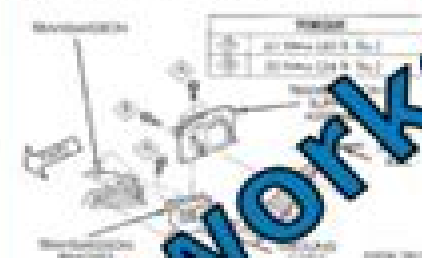
Fig. 27 Engine Mounting—Left