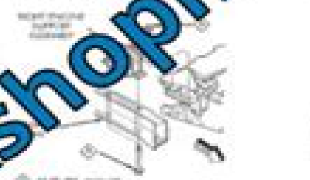
Fig. 28 Engine Mounting—Right Side