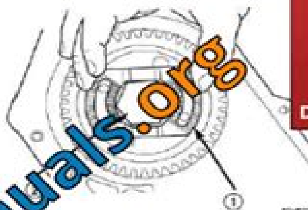
Fig. 171: Install Screen

Install oil pump-to-case bolts (1) and tighten.