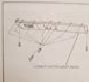
Fig. 32 Exploded view of the cruise control switch and master cable assembly