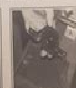
Fig. 36 Exploded view of the cruise control switch and master cable assembly