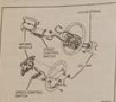
Fig. 26 Exploded view of the cruise control switch and master cable assembly

The speed sensor is a variable resistor that sends a signal to the cruise control module. The module will keep the cable tension in the vacuum line. For cable control on the vacuum line.