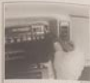
Fig. 29 Exploded view of the cruise control switch and master cable assembly