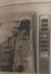
Fig. 31 Exploded view of the cruise control switch and master cable assembly