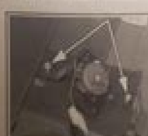
Fig. 35 Exploded view of the cruise control switch and master cable assembly