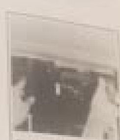
Fig. 30 Exploded view of the cruise control switch and master cable assembly