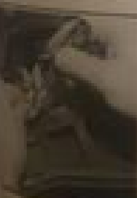
Fig. 34 Exploded view of the cruise control switch and master cable assembly