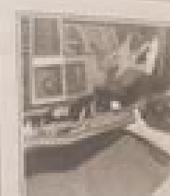
Fig. 33 Exploded view of the cruise control switch and master cable assembly