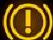
BRAKE SYSTEM LIGHT