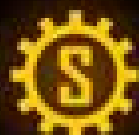
SPORT MODE INDICATOR