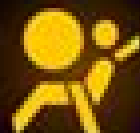
FRONT AIRBAG ACTIVATION