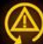
TRACTION CONTROL MALFUNCTION