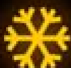
FREEZE WARNING INDICATOR LIGHT