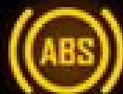
ANTI-LOCKING BRAKE SYSTEM