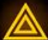
HAZARD LIGHTS ON