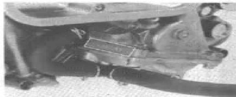
The carburetor identification number is on the carburetor body left side.