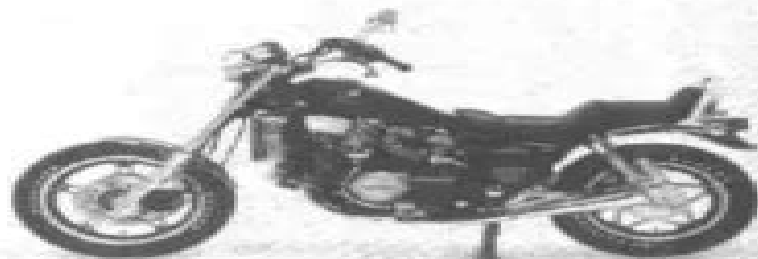
V45 MAGNA BEGINNING F NO. RC071 - CM000001 E NO. RC07E - 4000001