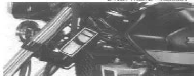
The vehicle identification number (VIN) is on the steering head left side.