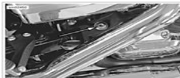
Figure 1-17. Transmission Filler Plug/Dipstick Location